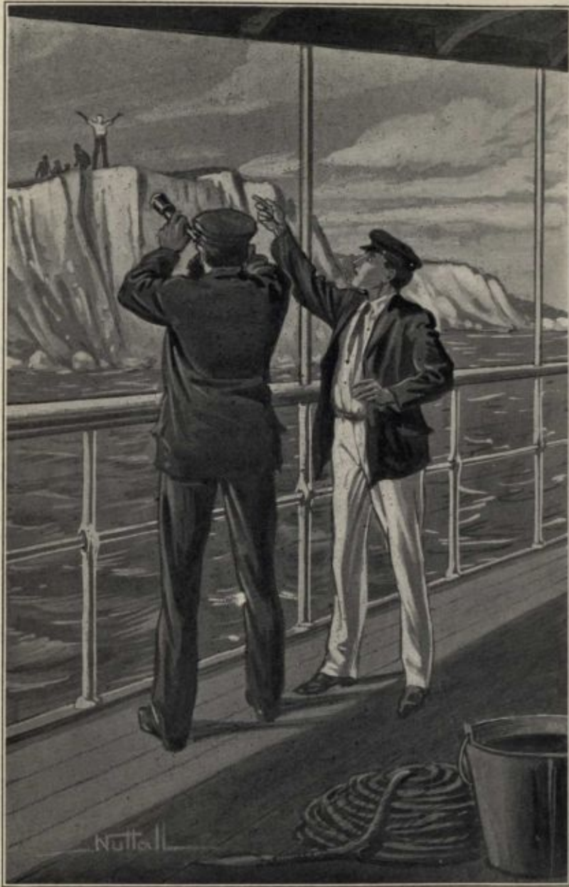
"LOOK AT THE HIGH CLIFF, CAPTAIN," URGED BOB.— Page 169.