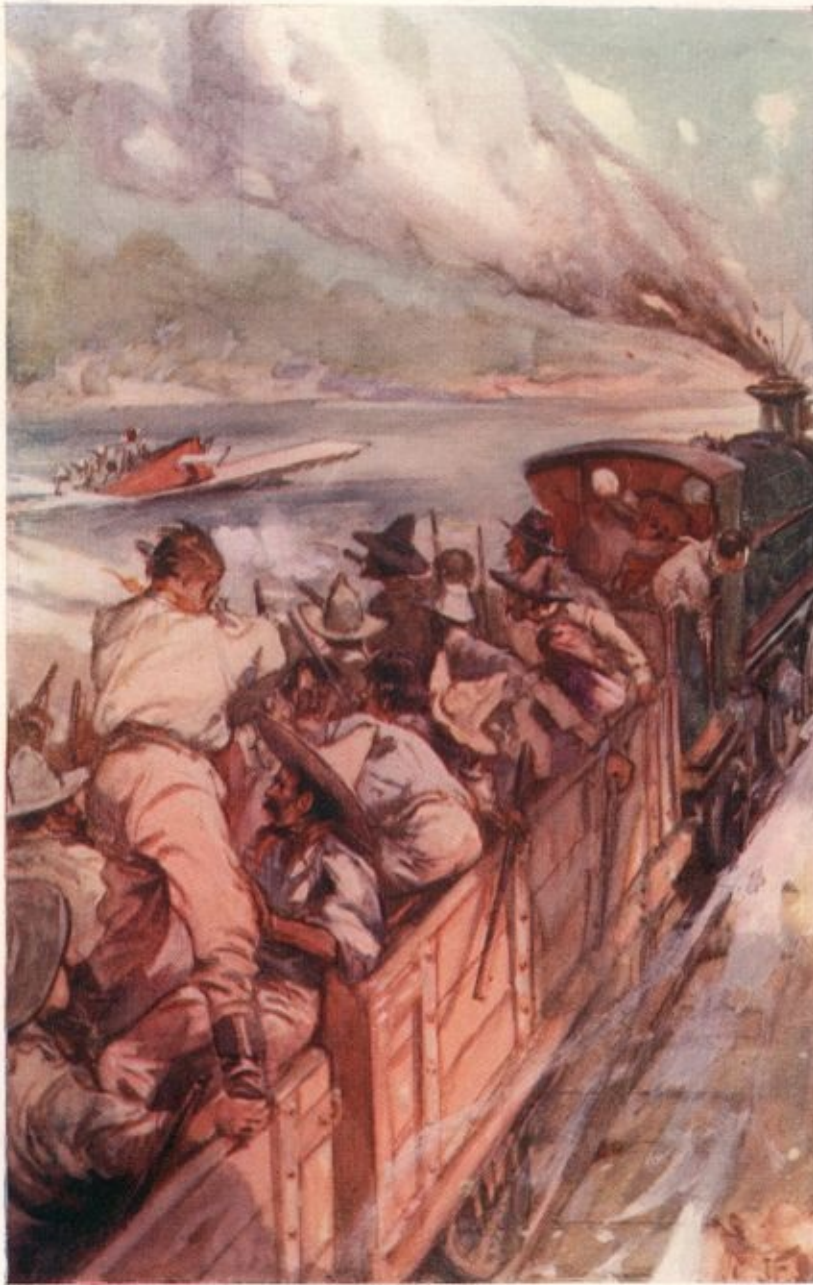
THE RACE TO THE SWIFT