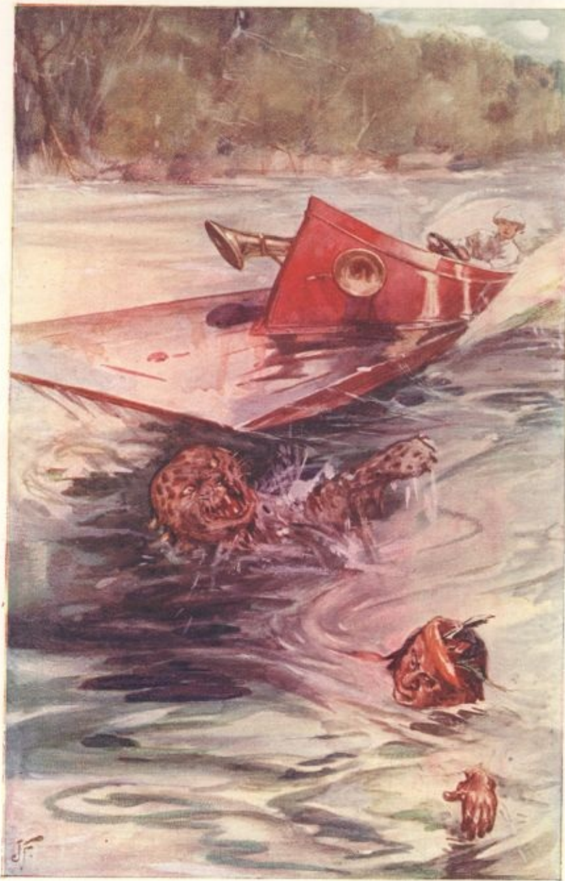
IN THE NICK OF TIME

Author of 'King of the Air,' 'Barclay of the Guides,' etc., etc.