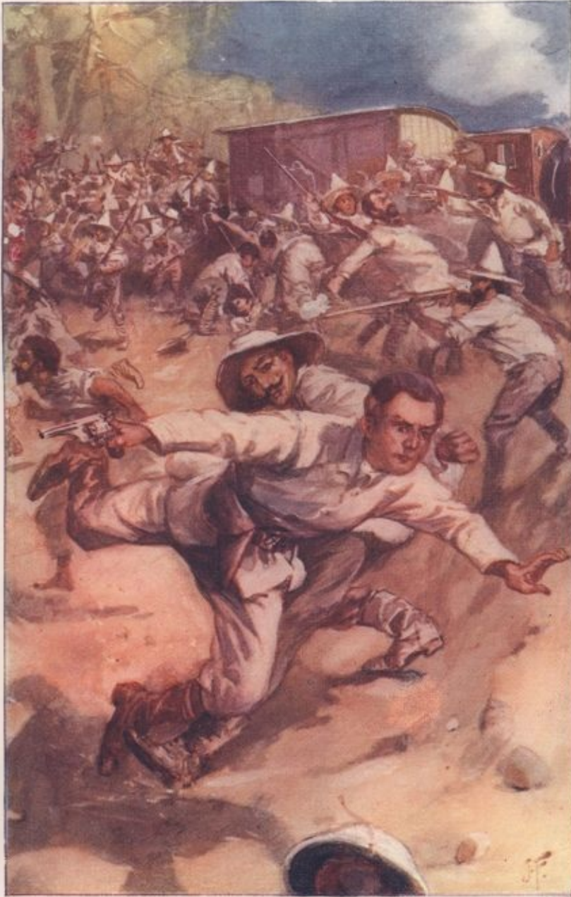
A SCRIMMAGE AT RAILHEAD