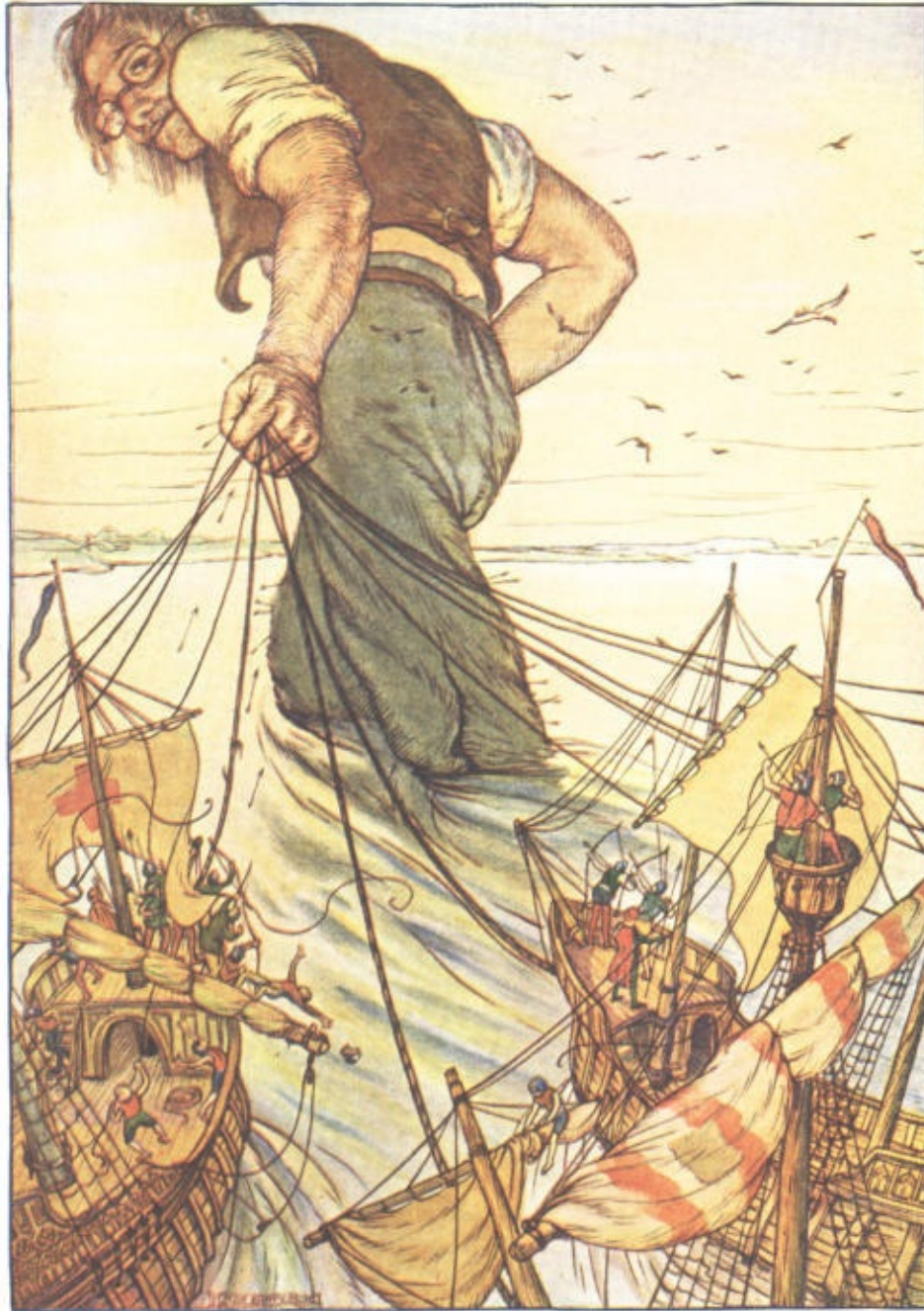
“They perceived the whole fleet moving in order”

About three weeks after this exploit there arrived a solemn embassy from Blefuscu, with humble offers of a peace; which was soon concluded upon conditions very advantageous to our emperor, wherewith I shall not trouble the reader. There were six ambassadors with a train of about five hundred persons; and their entry was very magnificent, suitable to the grandeur of their master and