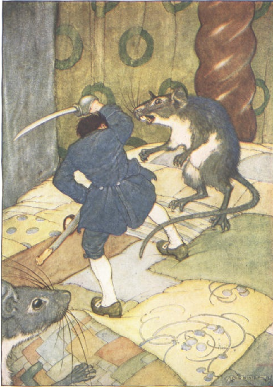
“These horrible animals had the boldness to attack me on both sides”

When dinner was done, my master went out to his laborers, and as I could discover by his voice and gesture, gave his wife a strict charge to take care of me. I was very much tired and disposed to sleep, which my mistress perceiving, she put me on her own bed, and covered me with a clean white handkerchief, but larger and coarser than the mainsail of a man of war.