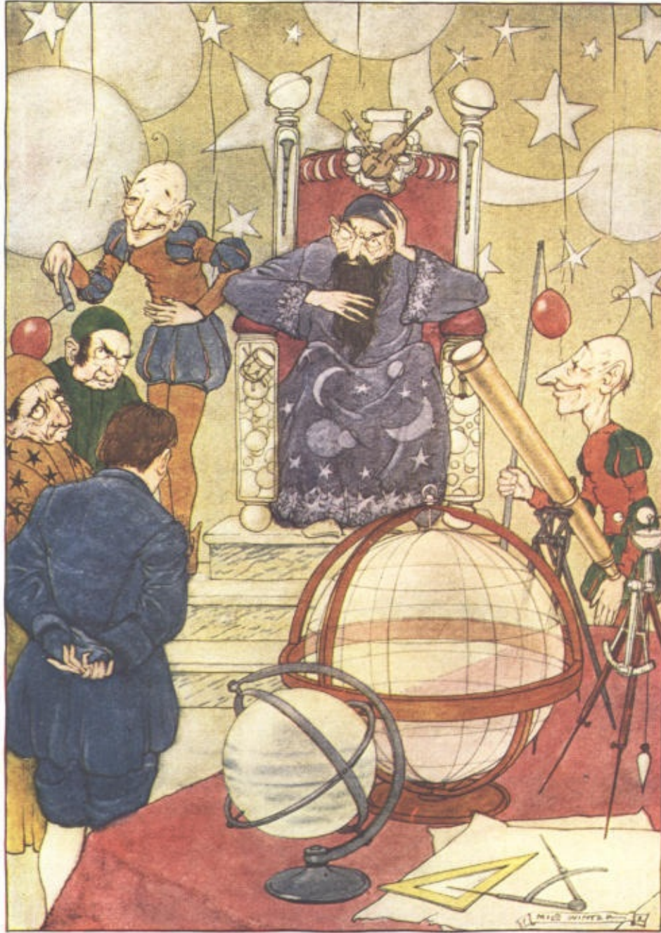
“At last we entered the palace”

These people are under continual disquietudes, never enjoying a minute’s peace of mind; and their disturbances proceed from causes which very little affect the rest of mortals. Their apprehensions arise from several changes they dread in the celestial bodies: for instance, that the earth, by the continual approaches of the sun towards it, must in course of time be absorbed or